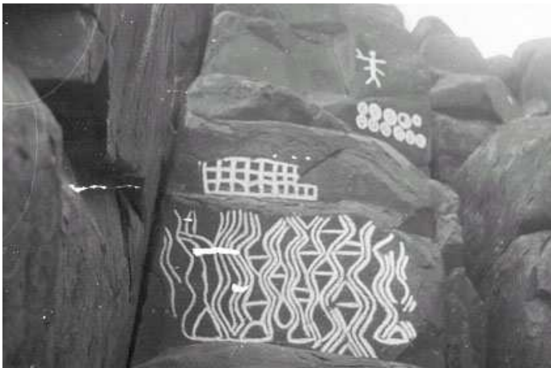
Figure 03: Device parietal site Santinho I Beach, SC.

Pointing still to questions about the production and duration of these graphic registers in the current state, it is impossible to say some questions do not stand up about the state of conservation and preservation of the same. So by the bibliographical revision it can be noticed the preoccupation from the authors with the constant abandon that is dedicated to this cultural inheritance. This problem can take into consideration the ignorance of the population about the importance and the meanings of these registers like inherited object of a group that lived and interacted in the whole region for a significant period of time. This lack of knowledge added up to the disregard of the authorities with the absence of clear and efficient politics about the conservation and preservation, are contributing to the quick disappearance of this pictographic art. In the past century, hunters of treasures and mining enterprises were responsible for the destruction of great part of this inheritance. According to the bibliographies consulted for this inquiry, 80 % of the graphic registers of the region of SC and near islands have already disappeared due not only to the entropic action, but also to intepéricos factors. Nowadays inspection policies and preservation began to be taken into account, but they act still in quite incipient way [3 e 4].