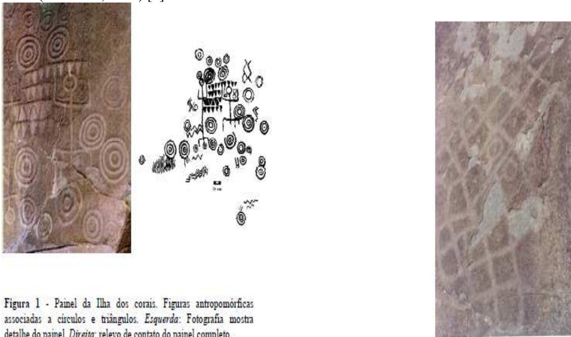
Figura 1 - Painel da Ilha dos corais. Figuras antropomórficas associadas a círculos e triângulos. Esquerda: Fotografia mostra detalhe do painel. Direita: relevo de contato do painel completo.

In what it refers to the type of signs, two types are identified, as of character are naturalists: antropomorfos (lifted arms), simple and double masks, human footprints and also the presence of zoomorphism like fishes. Regarding the geometrical motives it was observed the constant presence of parallel, wavy, vertical, horizontal aspects, zigzags, and circles, single and with divisions, concentric, as well as, the presence of a series of triangles with apexes directed up and down (AGUIAR, 2003) [2].