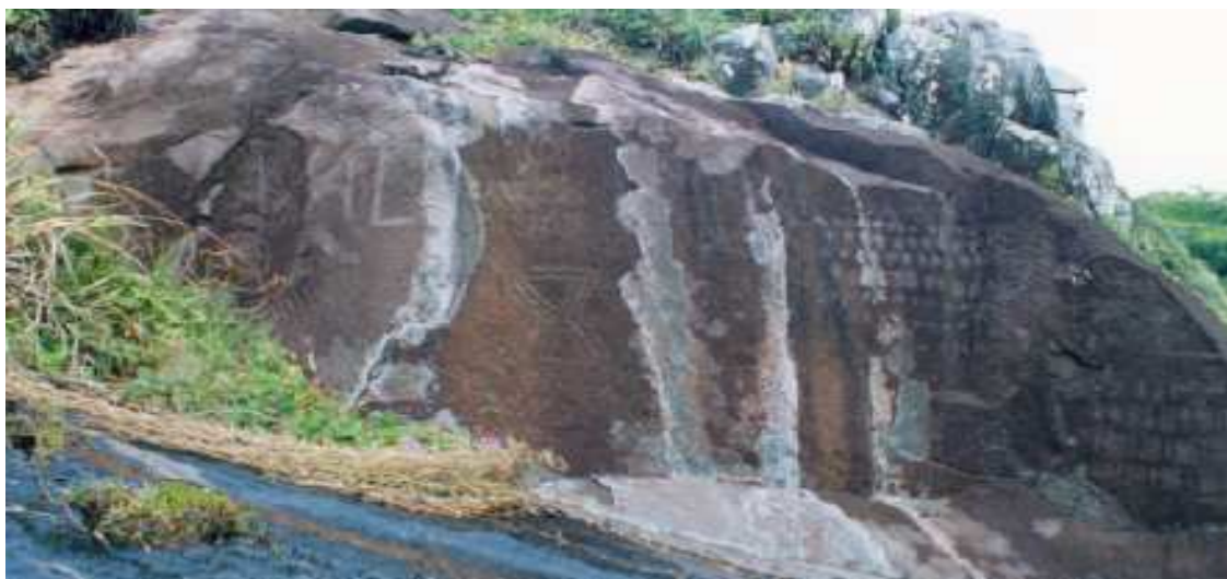
Figure 04: Sad Device parietal site, Ilha do Campeche, Florianópolis – SC.