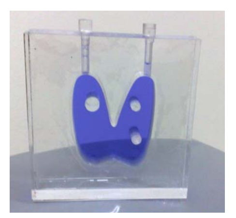
Figura 1: Image of the thyroid phantom with three nodules.

The phantom was built using acrylic, with sides of 10 cm and height of 11 mm. The inside acrylic volume it was molded with the geometry of a thyroid. The representative thyroid volume is 31 mL. In order to simulate nodules that do not have the capacity to capture radioactive material, it was used in the thyroid volume three of acrylic columns with diameter of 3.5 mm, 5 mm and 8 mm, respectively. Acrylic was chosen as material to form the phantom because it presents density close to the human body (d acrylic = 1.19 \text{ g/cm}^3 ; d human body \approx d water = 1 \text{g/cm}^3 ) [17]. Figure 1 shows a photograph of the phantom built for us; to better visualization the object was filled with water mixed with a blue colorant.